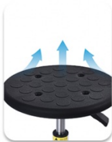
【 HIGHLY BREATH 】