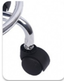
【 SMOOTHLY WHEEL 】