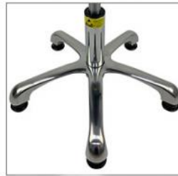
horseshoe aluminium chassis