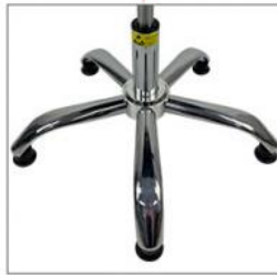
Five claws stainless Chassis