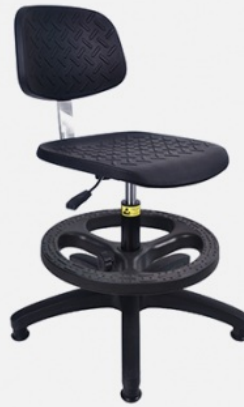
NYLON CASTERS WITH FOOTRING