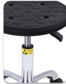
【UP AND DOWN ADJUSTABLE】