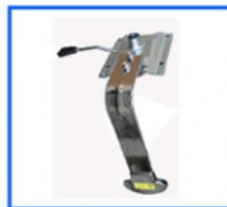
Back chair - fittings