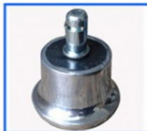
Aluminum Alloy Foot cup