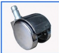
Aluminium Alloy Castor