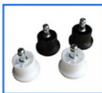
Hollow Foot Cup