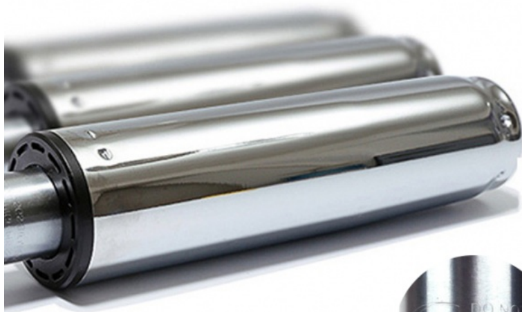
SGS Embossed stamp

Thickness:2mm Professional testing|safety and durable