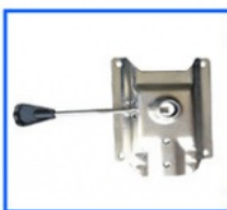
Backrest chair-plating tray