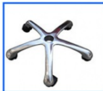
Aluminum Alloy Foot