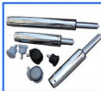
Gas lifting lever