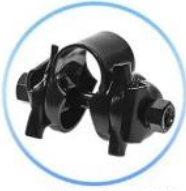
Removable Seat Holder