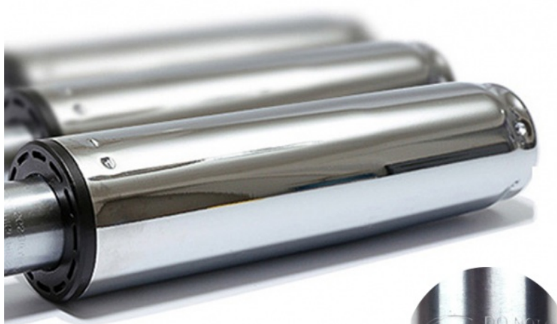
SGS Embossed stamp

Thickness:2mm Professional testing|safety and durable