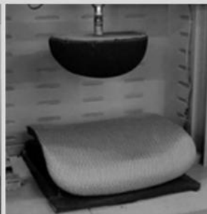
CHAIR BASE PRESSURE TEST